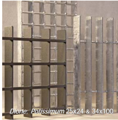
Dione: Potissimum 25x24 & 34x100