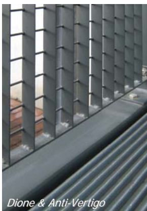
Dione & Anti-Vertigo